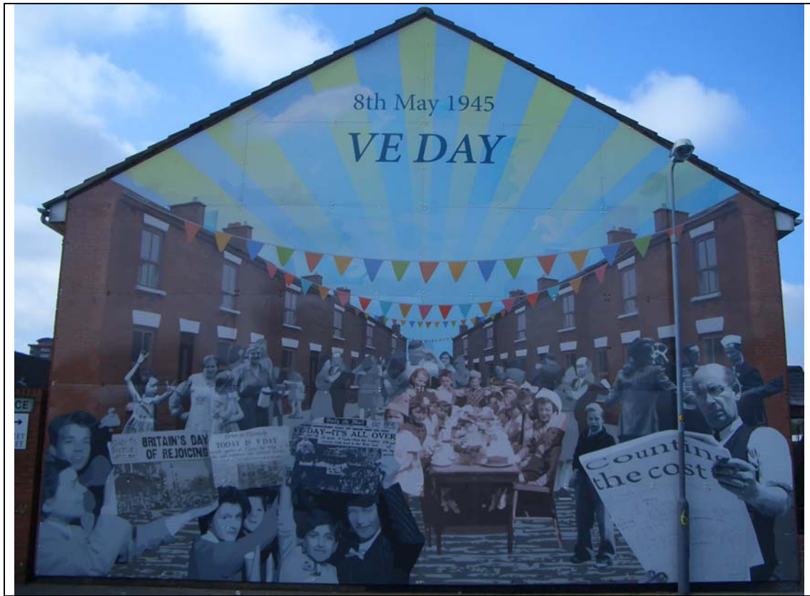
Lower Shankill – Peter's Hill